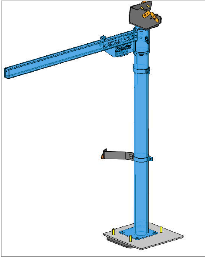
PLUG & PLAY Kit - Left : STA11992 Rope in option PLUG & PLAY Kit - Right : STA11991 Rope in option Crane not included on the kit

A lifting crane must be secured to lift loads with a complete serenity.